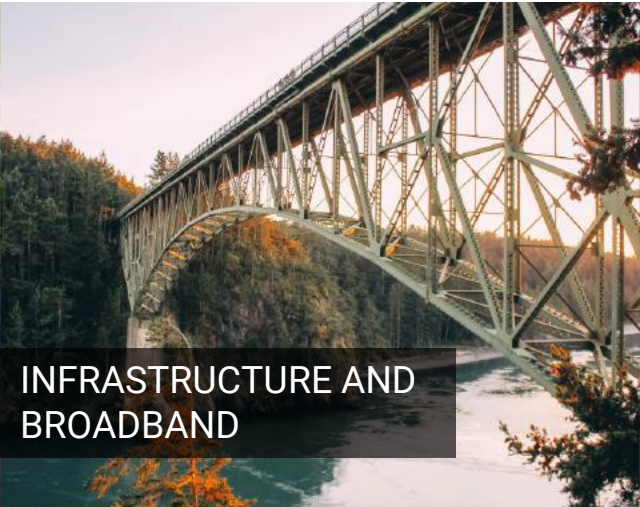
INFRASTRUCTURE AND BROADBAND