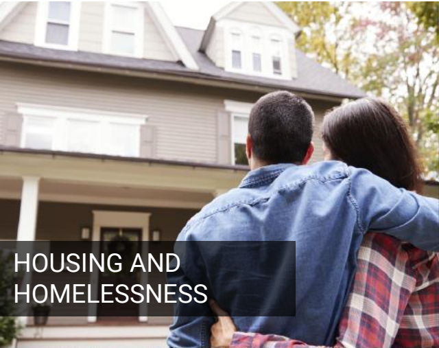
HOUSING AND HOMELESSNESS