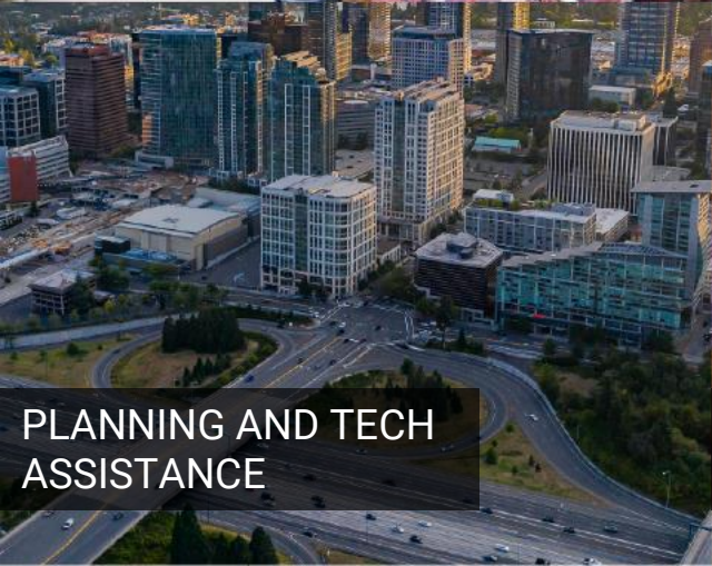
PLANNING AND TECH ASSISTANCE