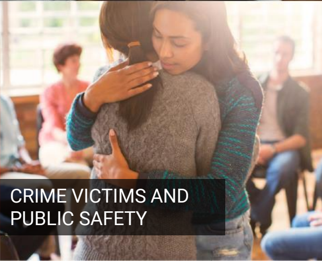
CRIME VICTIMS AND PUBLIC SAFETY