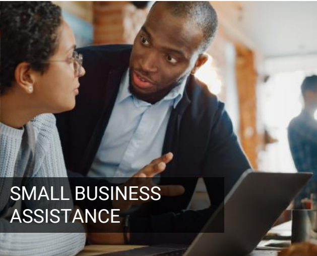
SMALL BUSINESS ASSISTANCE