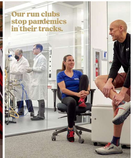
Just Evotech Biologics