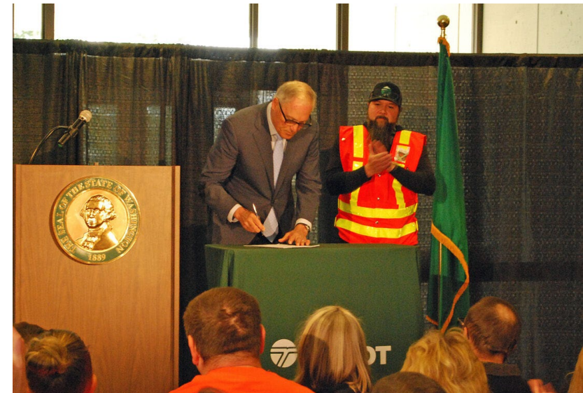
Governor Inslee signed this bill into law at the WSDOT Worker Memorial Ceremony, April 4, 2023