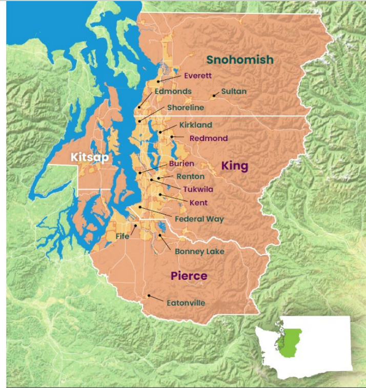
SS4A Planning grants, awarded or submitted