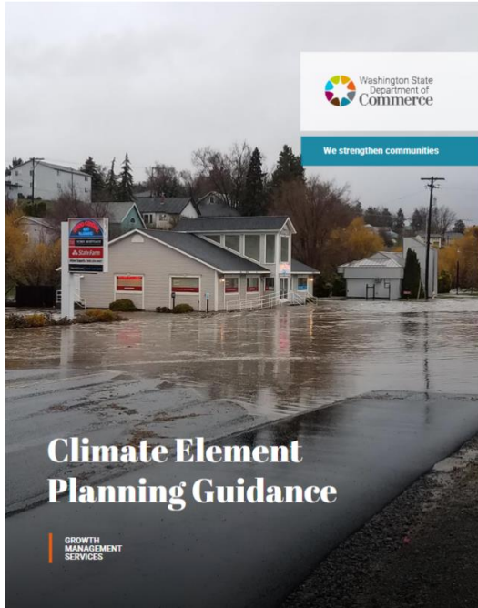
Commerce: Climate Program