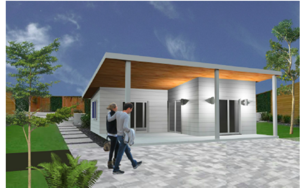
1 BEDROOM EXTERIOR RENDERING