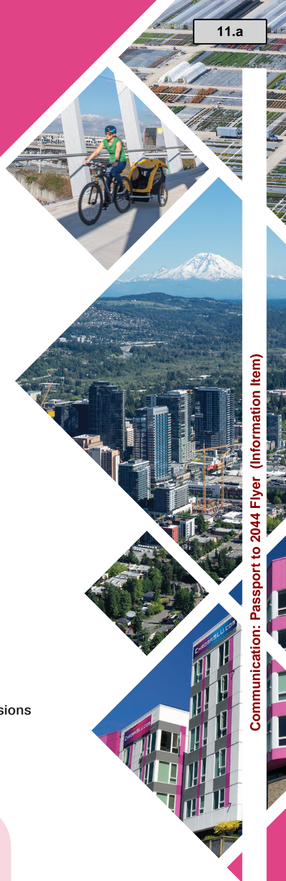
Communication: Passport to 2044 Flyer (Information Item)

The primary audience for these workshops are the planners, consultants, and staff most involved with comprehensive planning, but elected officials, planning commissioners, and others with a role in the upcoming comprehensive plan updates are also welcome to attend.