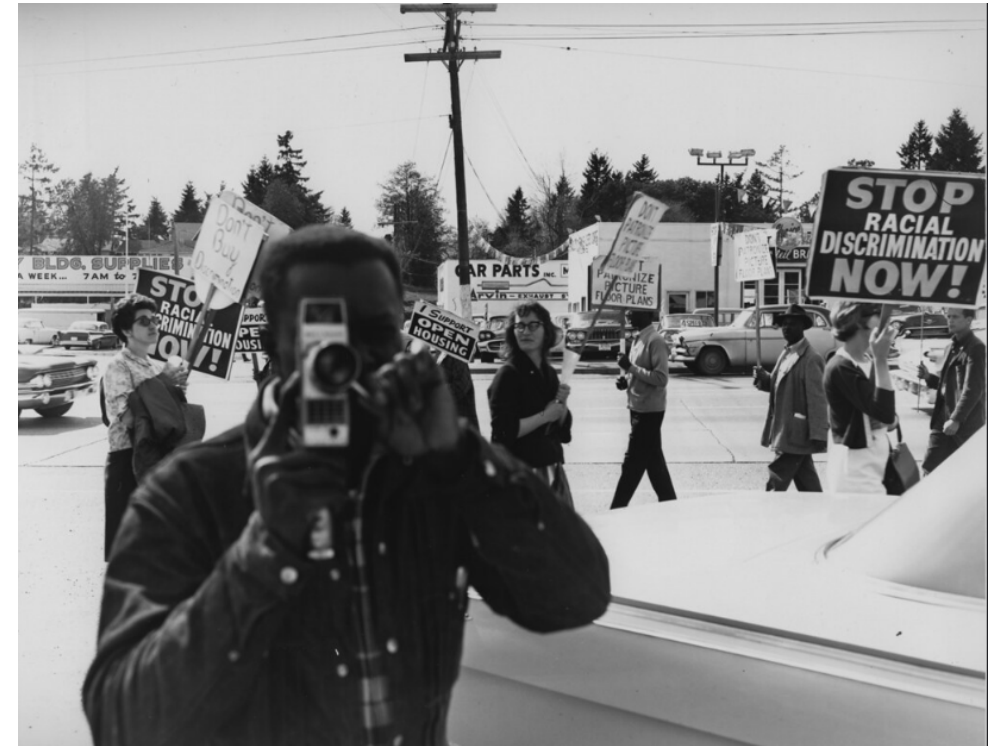
Filming the police at fair housing protest. Seattle, WA.