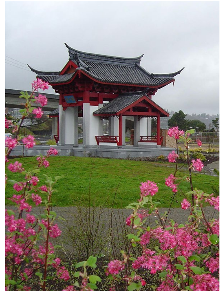
Tacoma Chinese Reconciliation Park. Tacoma, WA.