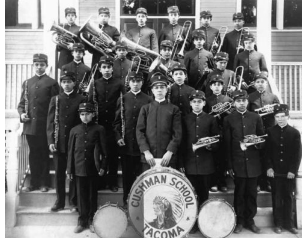
Native American students at the Cushman School. Tacoma, WA.