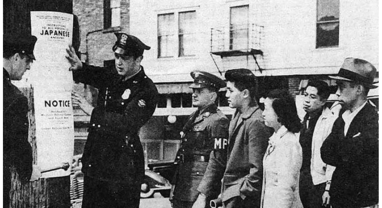
Officers posting Japanese Exclusion Order. Seattle, WA.