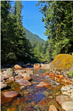
Sauk River, Snohomish County