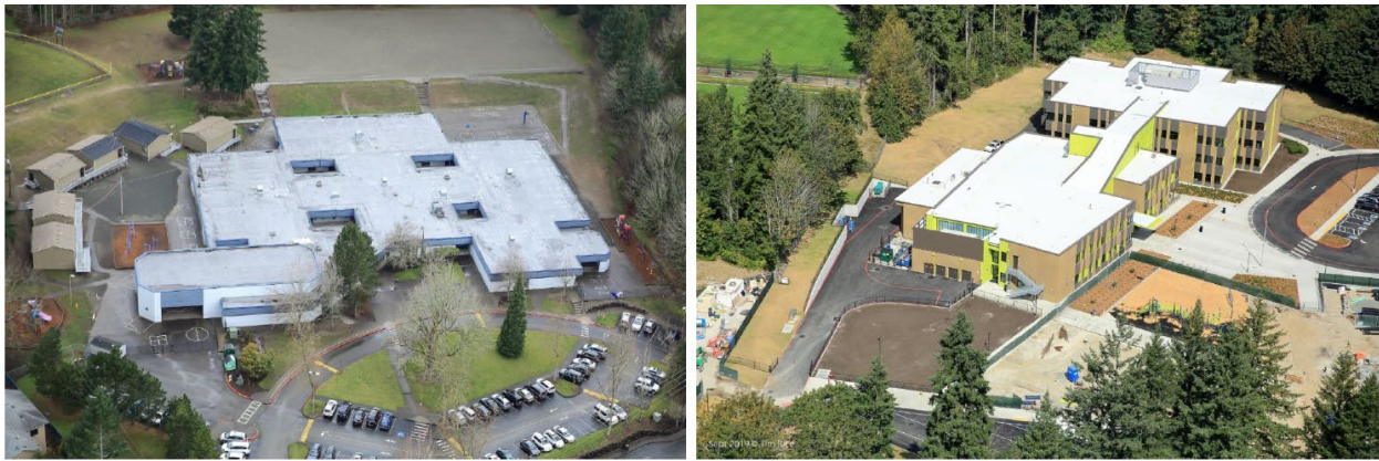
Figure 4 – Mead Elementary School before and after 2019 remodel