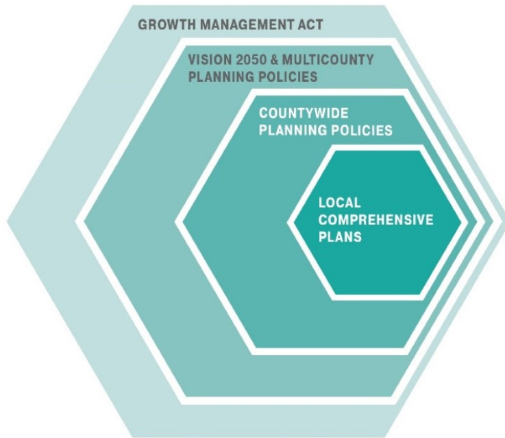
Figure 1 - Washington State Planning Framework

In 2015, the Washington State Legislature formed the Legislative Task Force on School Siting to review school facility and siting challenges. The task force, composed of state lawmakers, school district representatives, and other stakeholders, reviewed the issue of siting schools inside and outside the urban growth area, including impacts to transportation, compatibility with local and regional growth plans, availability, and cost of providing utilities and public services, and financial sustainability. The task force developed a statement of intent and 11 recommendations to update statewide school siting policies in December 2015. The statement of intent reaffirmed the value of schools that serve as hubs for their communities, and that minimizing travel time to and from schools is in the best interest of students, parents, and communities. This was a key step prior to the Legislature’s 2017 GMA updates.