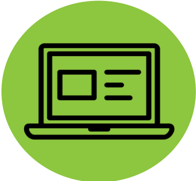
Online Engagement Platform