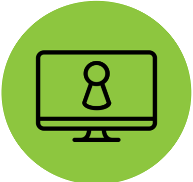
Virtual Outreach Meetings